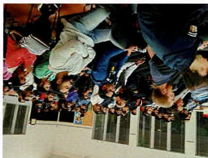
Career Guidance Seminar